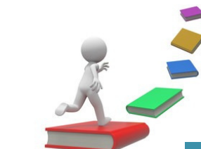
Well EDU Class