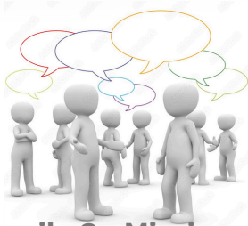
Family On Mission