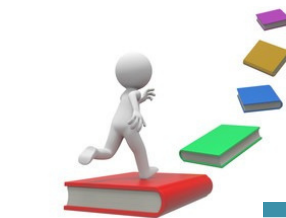
Well EDU Class