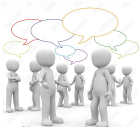
Family On Mission